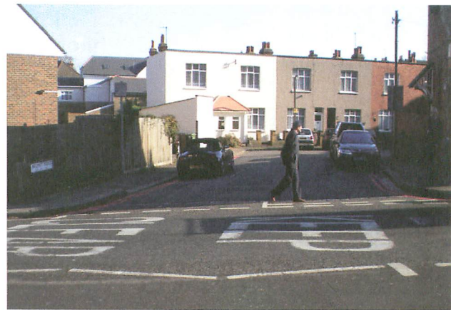
▲ Location of proposed entry treatment

Decluttering of traffic signage along the length of the scheme. Any unnecessary signs will be removed and where possible signs will be relocated to street lights and redundant posts will be removed.