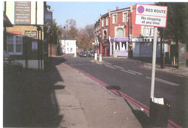
▲ Location of proposed junction improvements