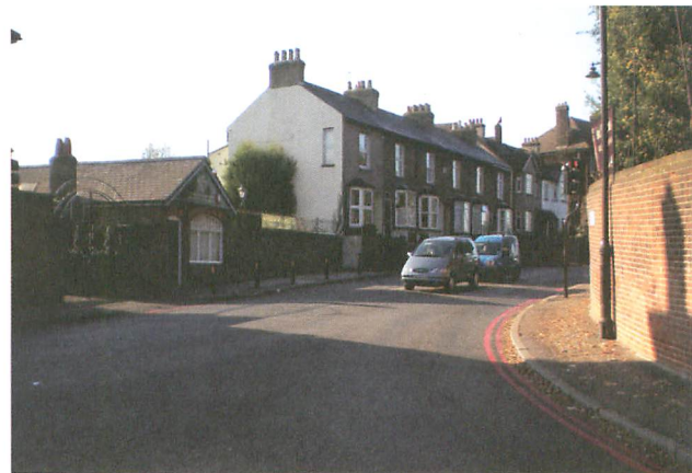
▲ Narrow footway to be widened