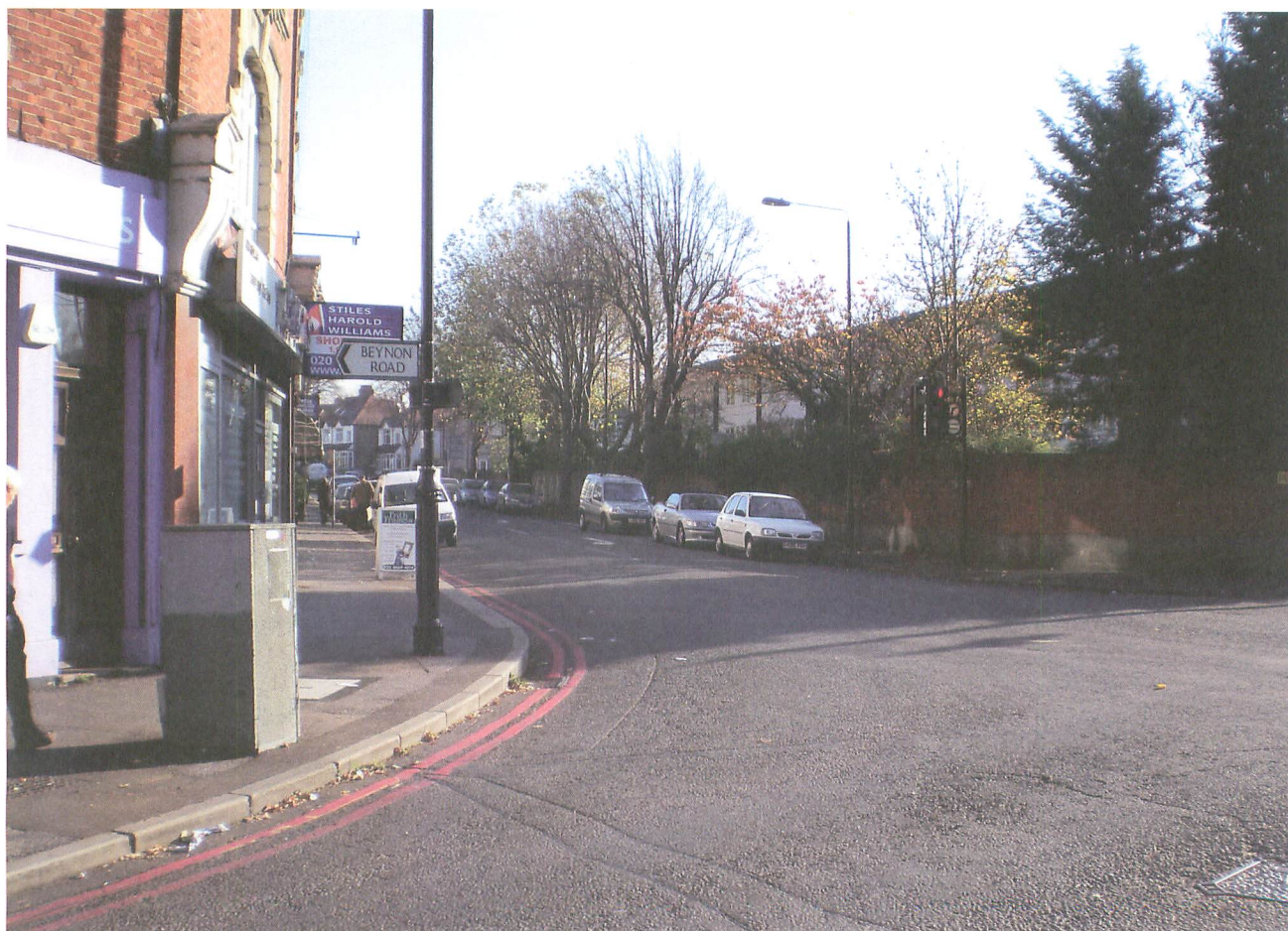
▲ Lack of existing pedestrian crossing facilities

If you require additional copies of this leaflet or a copy in another language, Braille, audio or large format, please call 0207 027 3499.